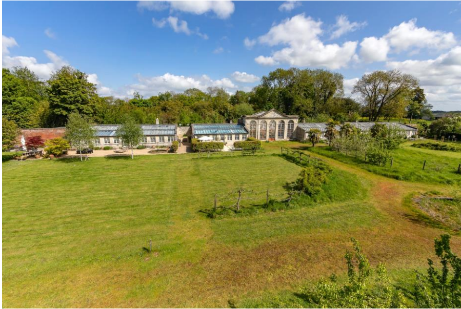
2 Garden Cottages, Wardour, Tisbury, Wiltshire SP3 6SE Gross Internal Area (Approx.) 112 sq m / 1,203 sq ft