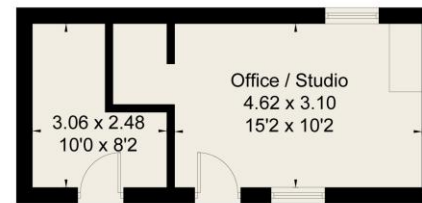
Outbuilding (Not Shown In Actual Location / Orientation)